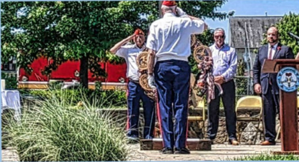
Memorial Day 2022 Lovettsville