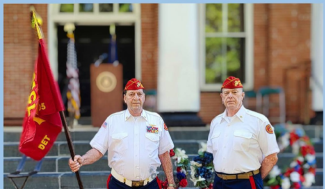
Memorial Day 2022 Leesburg