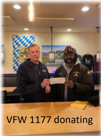
VFW 1177 donating